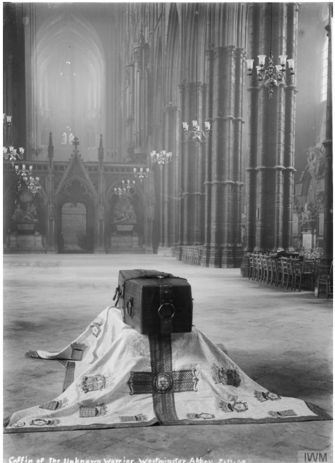
Coffin of the Unknown Warrior Westminster Abbey 7.11.20

Armistice day 1920 was marked with a 2 minute's silence throughout the land, as it had been in 1919. However in 1920, 2 significant events happened; the unknown soldier was buried in Westminster Abbey,